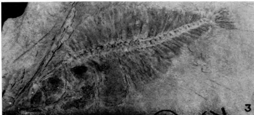
FIGS. 1, 3. 1, Scombroclupea murlii , sp. nov., \times 2.1 ; 2, Palimphyes misrai , sp. nov., \times 1.4 ; 3, Eobothus singhi , sp. nov., \times 1.3 .